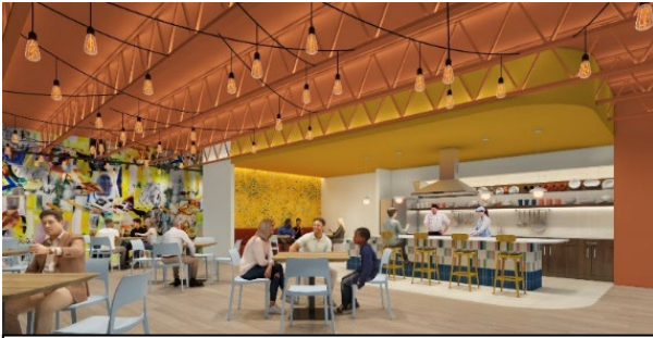
The multipurpose room will provide workshop space, demo kitchen, and support one-off and periodic workshops and programs.