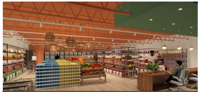
The expanded Food Pantry will be set up like a grocery store for clients to choose from a variety of food and produce items.

As the social safety net continues to erode, CARES will provide the stability and flexibility needed to ensure that immigrant and low-income families on Chicago’s Northwest Side can access the care and support they need to thrive.